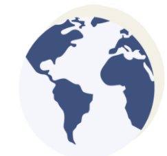
Regional engagement (especially in developing countries)