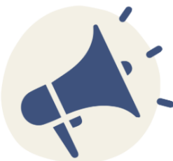
Visibility and global outreach