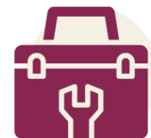
Starter pack for new groups