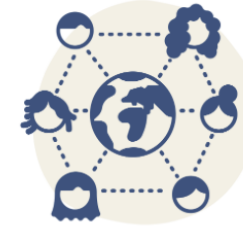
Collaboration, connectivity and networking across women's groups